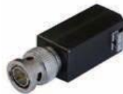
DS-1H18 Video Balun